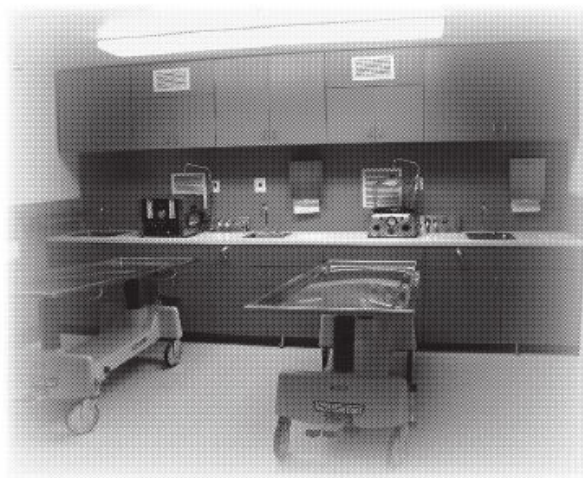
North Sacramento Funeral Home, Sacramento, CA

DST offers a specialty one-stop service that encompasses design and equipment, much of which is exclusive to their firm. The company's flagship service is Premier Source design, a plan that recommends a logical, effective layout for the prep room. It is designed specifically with provisions